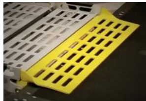
Upper Load Bearing Plate