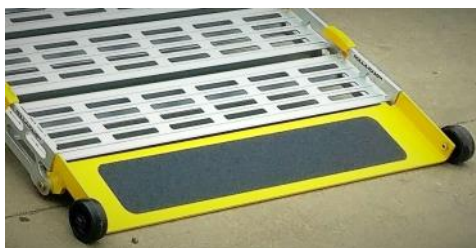
Lower Wheeled Plate Allows for movement up and down