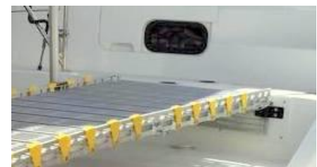
Optional Bracket Mount Kit Temporary secure ramp to boat or pier