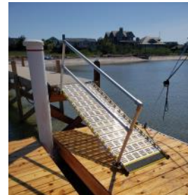
Optional Handrails One side or both