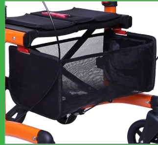
Folding Shopping Bag 500-3000