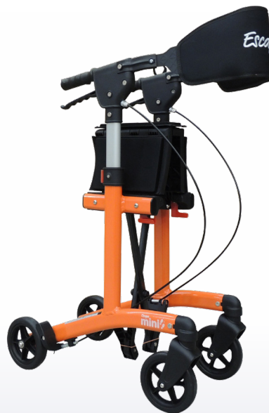
Spring-assist Folding Folds with a single lift of the seat handle. Escape mini stands independently when folded.