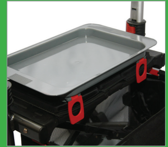
Plastic Tray 500-4300