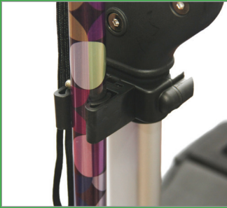
Cane Holder (cane not included) 500-4100

Escape offers a variety of high-quality accessories that help enhance the walker comfort and performance. These can be purchased separately.