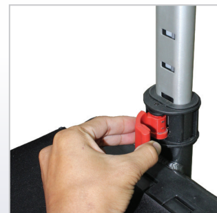
Easy to adjust handle height