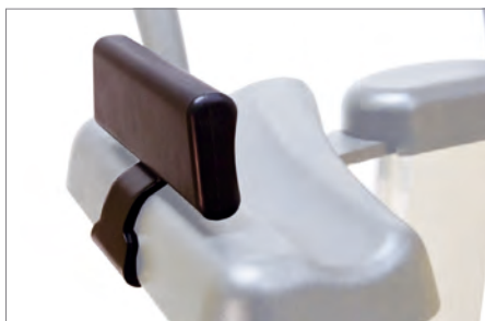
Forearm side support (pair)