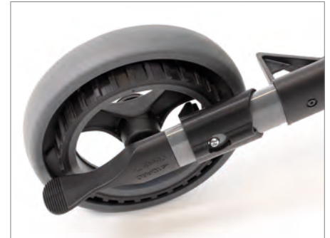
The edge guard and the Reverse Braking System (RBS) make everyday life easier. Permanently braked; pull to walk/release to stop.