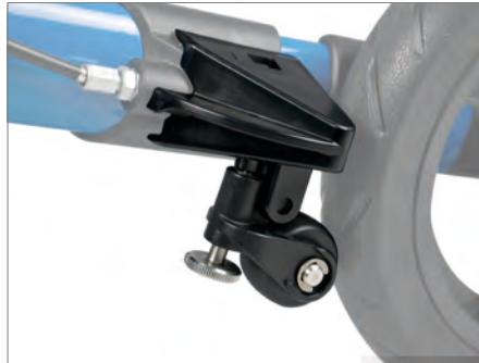
Roll Resistance System (RRS) installed beneath the edge guard.

This is fitted above or below the edge deflector on the wheel and is seamless adjustable using the small dial. This enables the rollator's resistance to be individually adapted to the needs of the user – so that the user always has the optimum resistance to be able to walk safely and evenly.