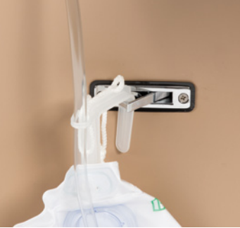
Accessory Hook Shown here with Foley bag