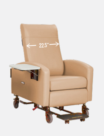
X-Large 500 lb Capacity