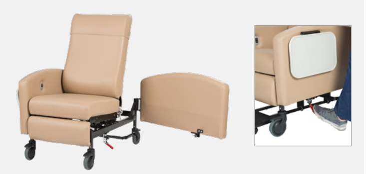
Upholstered Swing Arm Shown

Urethane Cap Option Urethane arm caps provides a unique, upscale appearance and added durability.