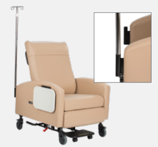
IV Holder Mount Available for left, right or both sides