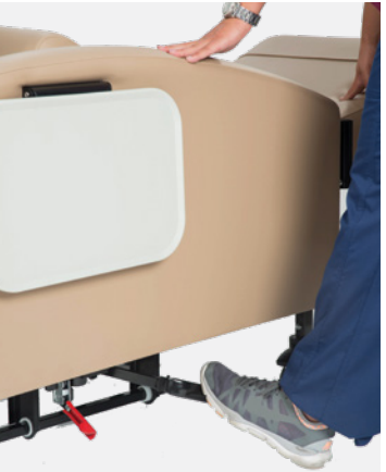
Foot lever for exclusive Secure-Glide<sup>®</sup> Trendelenburg descent