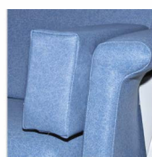
Side Cushion SC00